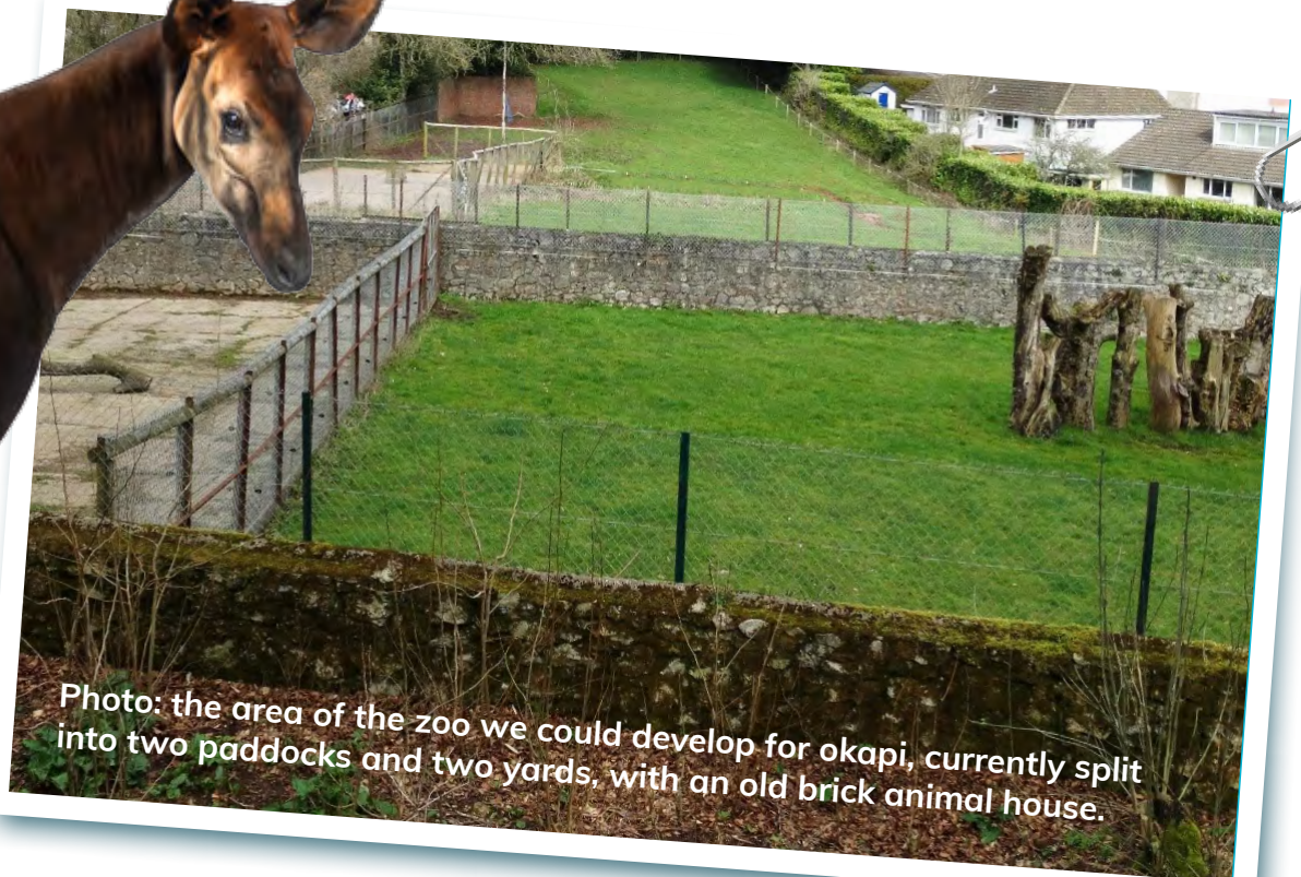
Photo: the area of the zoo we could develop for okapi, currently split into two paddocks and two yards, with an old brick animal house.